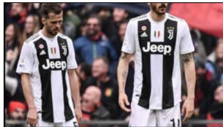
Juventus have suffered their first Serie A

TURIN (Dispatches) - Juventus have suffered their first Serie A defeat of the season losing 2-0 to Genoa days after the Turin club's heroics against Atletico Madrid.