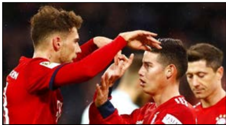
Bayern's James, right, celebrates with teammate Leon Goretzka after scoring during the German Bundesliga soccer match between FC Bayern Munich and 1. FSV Mainz 05 in Munich, Germany, March 17, 2019.

BERLIN (Dispatches) - Bayern Munich have returned to the top of the Bundesliga with a record-setting 6-0 rout of Mainz, more than answering Borussia Dortmund's challenge a day earlier.