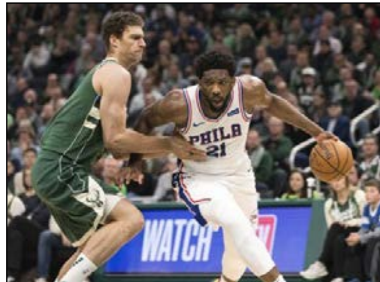
Mar 17, 2019; Milwaukee, WI, USA; Philadelphia 76ers center Joel Embiid (21) drives for the basket against Milwaukee Bucks center Brook Lopez (11) during the fourth quarter at Fiserv Forum.

WASHINGTON (Dispatches) - Joel Embiid has scored 40 points and grabbed 15 rebounds to lead the visiting Philadelphia 76ers past the Milwaukee Bucks 130-125.