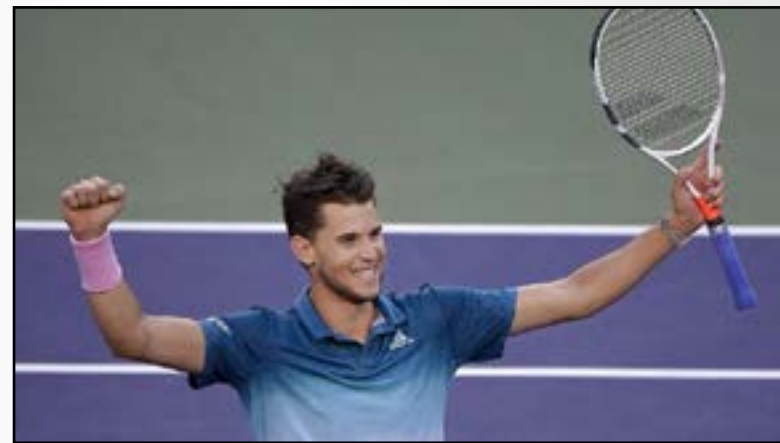
Dominic Thiem, of Austria, celebrates after defeating Roger Federer, of Switzerland, in the men's final at the BNP Paribas Open tennis tournament March 17, 2019, in Indian Wells, Calif.

Federer was in the final for the third straight year and lost for the second year in a row. He was beaten in a third-set tiebreaker by Juan Martin del Potro last year. Federer won his 100th career title in Dubai recently.