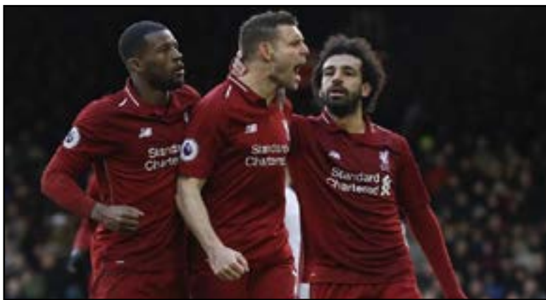
Liverpool's James Milner, center, celebrates with teammates Georginio Wijnaldum, left, and Mohamed Salah after scoring his side's second goal, during the English Premier League soccer match between Fulham and Liverpool at Craven Cottage stadium in London, March 17, 2019.

their quest for an unprecedented quadruple. Pep Guardiola's side has already won the English League Cup, is into the Champions League quarterfinals, and now knows it will play Brighton in the last four of the FA Cup.