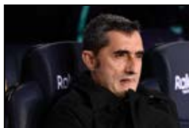
Ernesto Valverde won a league and Copa del Rey double in his first season at Barcelona.

MADRID (AFP) - Spanish champions Barcelona announced Friday they have extended the contract of coach Ernesto Valverde for another season with the option of one more.