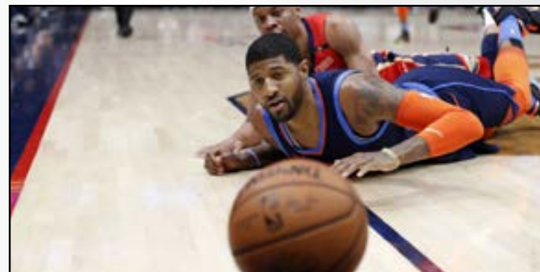
Oklahoma City Thunder forward Paul George, front, and New Orleans Pelicans guard Tim Frazier watch the ball go out of bounds during the first half of an NBA basketball game in New Orleans, Thursday, Feb. 14, 2019.

scored 28 points, had seven rebounds and made six assists.