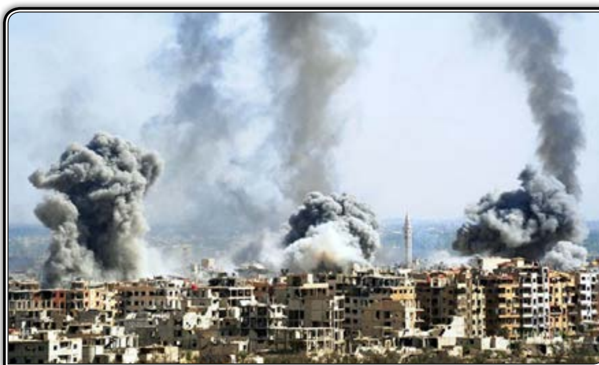
Smoke rises from the terrorist-held Douma district of Eastern Ghouta, on the outskirts of Damascus, on April 7, 2018.

MOSCOW (Dispatches) -- The Russian military said Wednesday it was closely watching the situation around Syria and was aware of the movements of a U.S. naval strike force headed for the Persian Gulf.