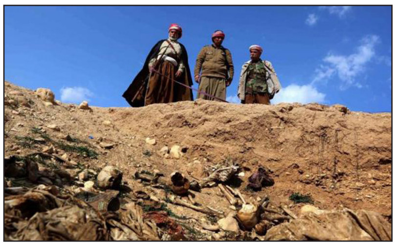
The file photo shows people looking at a mass grave of Izadi Kurds murdered by Daesh terrorists near the Iraqi town of Sinjar.

BAGHDAD (Dispatches) – Iraqi security officials say government forces have found a mass grave in the country's northern province of Nineveh, containing the bodies of dozens of members of Izadi minority, who are believed to have been executed by Daesh terrorists when they were in control of a terrain.