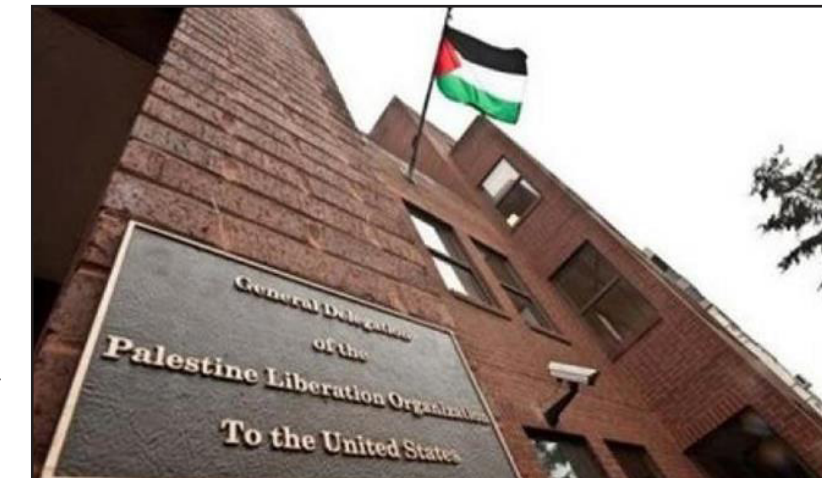
The Palestinian Liberation Organization's office in Washington, DC

The administration of U.S. President Donald Trump has 90 days to determine if the Palestinians are in "direct and meaningful negotiations with Israel." If so, the mission will