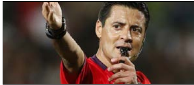
Iranian international referee Alireza Faghani

ZURICH (Dispatches) - Iranian international referee Alireza Faghani has been selected to officiate at the 2018 World Cup in Russia.