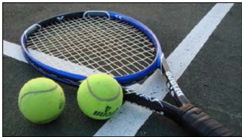
Iran is going to host the next edition of U13 West Asian Tennis Tournament in Kish Island in the Persian Gulf.

TEHRAN (Press TV) - A high-ranking Iranian sports official says the Islamic Republic is going to host the next edition of U13 West Asian Tennis Tournament in Kish Island in