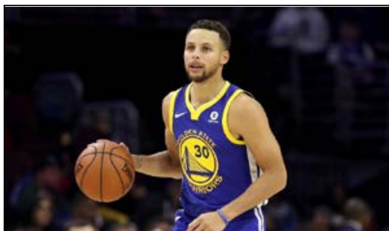
Stephen Curry of the Golden State Warriors scored 35 points, 20 in the third quarter alone, as the Warriors roared back after half-time to beat the Philadelphia 76ers 124-116

LOS ANGELES (AFP) - Stephen Curry scored 35 points as the Golden State Warriors