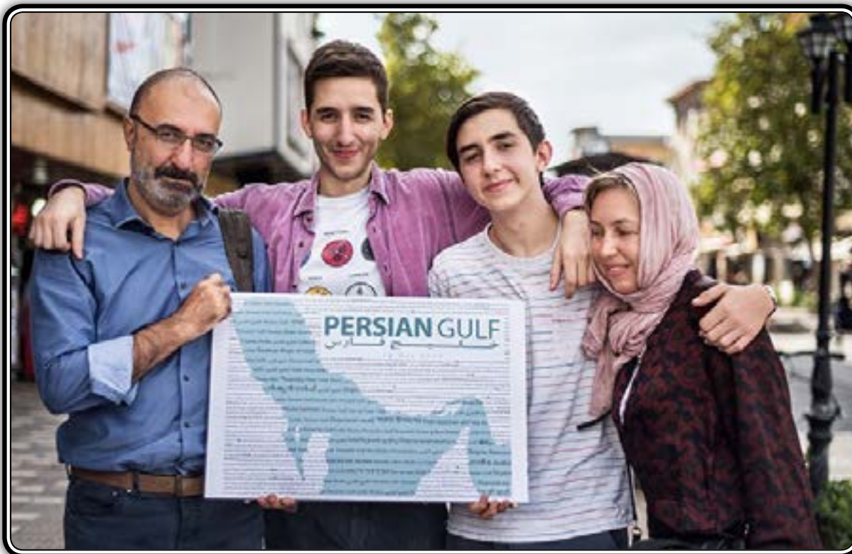
A family in Tehran holds up a placard of the "Persian Gulf" in a sign of protest at U.S. President Donald Trump's wrong reference to the body of the waters, which Iranians think was intentional.

TEHRAN (Dispatches) – Tehran is a city that wears its political colors on its sleeve but U.S. President Donald Trump's insulting speech on Friday has brought Iranians of all hues and inclinations together.