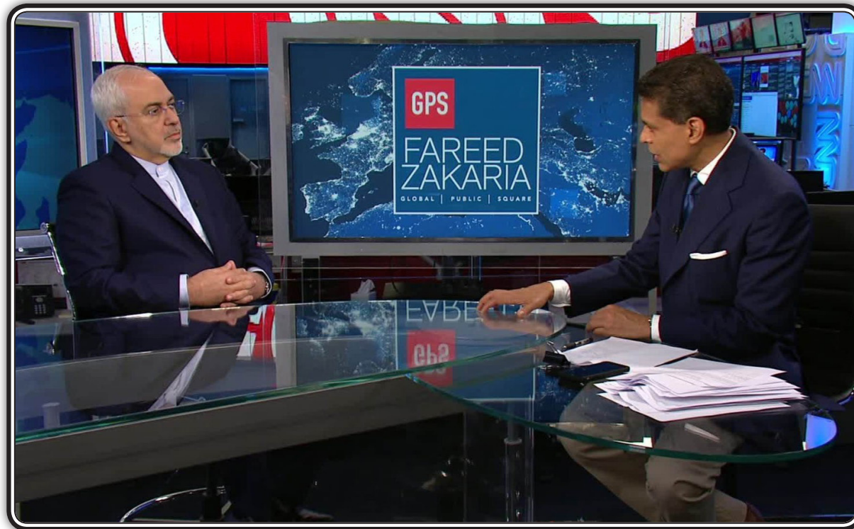
CNN's Fareed Zakaria interviews Iran's Foreign Minister Muhammad Javad Zarif.

TEHRAN (Dispatches) – Iranian Foreign Minister Muhammad Javad Zarif has ripped the U.S. as “unreliable” in the wake of a report saying the Trump administration was leaning toward decertifying the nuclear deal with Tehran.