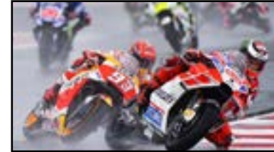
Repsol Honda Team's Spanish rider Marc Marquez (L) and Ducati Team's Spanish rider Jorge Lorenzo compete during the San Marino Moto GP Grand Prix at the Marco Simoncelli Circuit in Misano, on September 10, 2017.

Italian Valentino Rossi, who is fourth in the championship on 157 points, broke his leg in training last week.