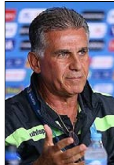
Iran coach Carlos Queiroz

HONG KONG (Reuters) - Iran coach Carlos Queiroz has urged the country's football officials to commit more funding to the preparations for next year's World Cup finals or risk elimination in the group stages yet again.