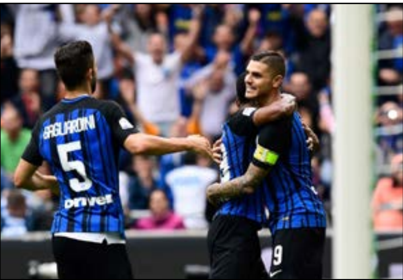
Inter Milan's Mauro Icardi (R) celebrates after scoring in the Serie A match against SPAL at the San Siro stadium in Milan, on September 10, 2017.

MILAN (AFP) - Napoli and Inter Milan made it three wins out of three to keep pace with six-time title holders Juventus at the top of Serie A Sunday as AC Milan fell at Lazio.