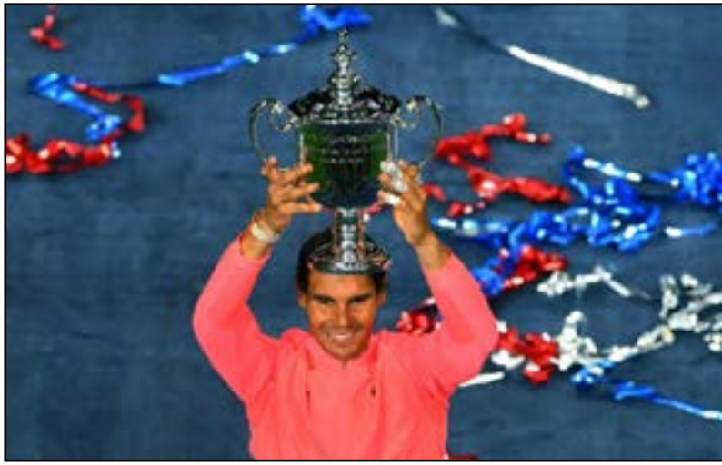
World Number 1 Rafael Nadal has bagged his 16th Grand Slam title after overwhelming a towering Kevin Anderson 6-3, 6-3 and 6-4 in the US Open Final.

The result means this year's major titles are shared between Nadal, at the French and U.S. Opens, and Roger Federer, at the Australian