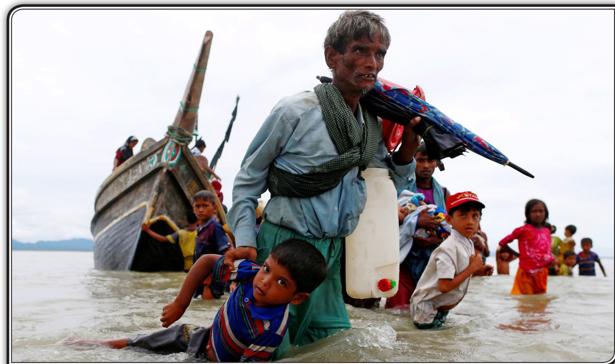
A Rohingya refugee pulls a child as they walk to shore after crossing the Bangladesh-Myanmar border by boat on Sept. 10, 2017.

GENEVA/SHAMLAPUR, Bangladesh (Dispatches) -- The United Nations' top human rights official on Monday slammed Myanmar for conducting a "cruel military operation" against Rohingya Muslims in Rakhine state, branding it "a textbook example of ethnic cleansing." Zeid Ra'ad al-Hussein's com-