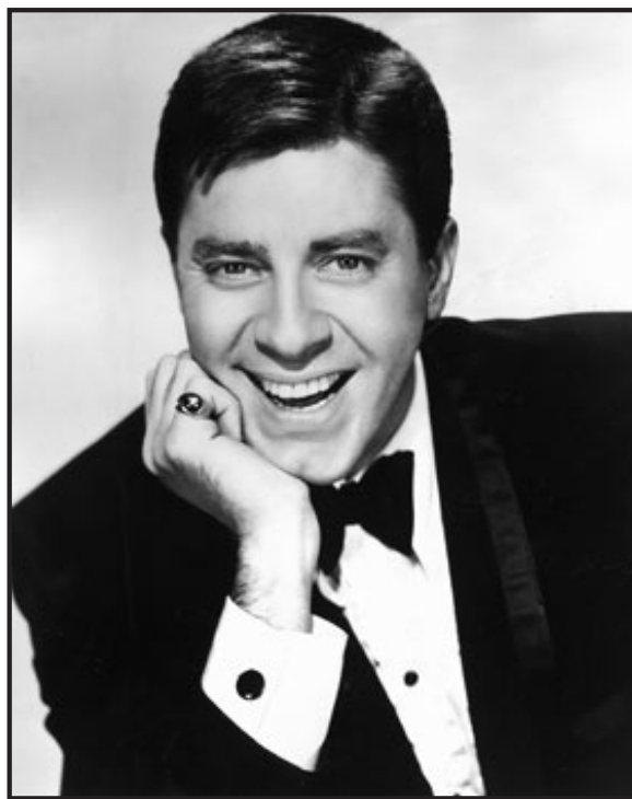
Jerry Lewis wrote, produced and directed many of his own films.