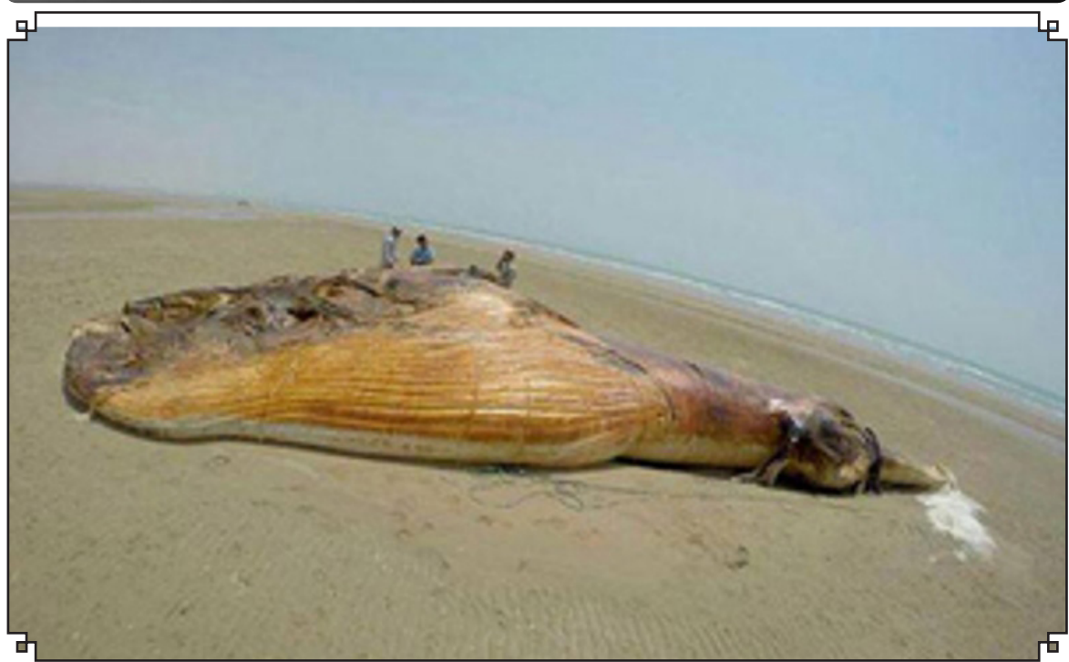
The carcass of a whale has been found dead off the shores of the coastal city of Bandar Lengeh, Iran.