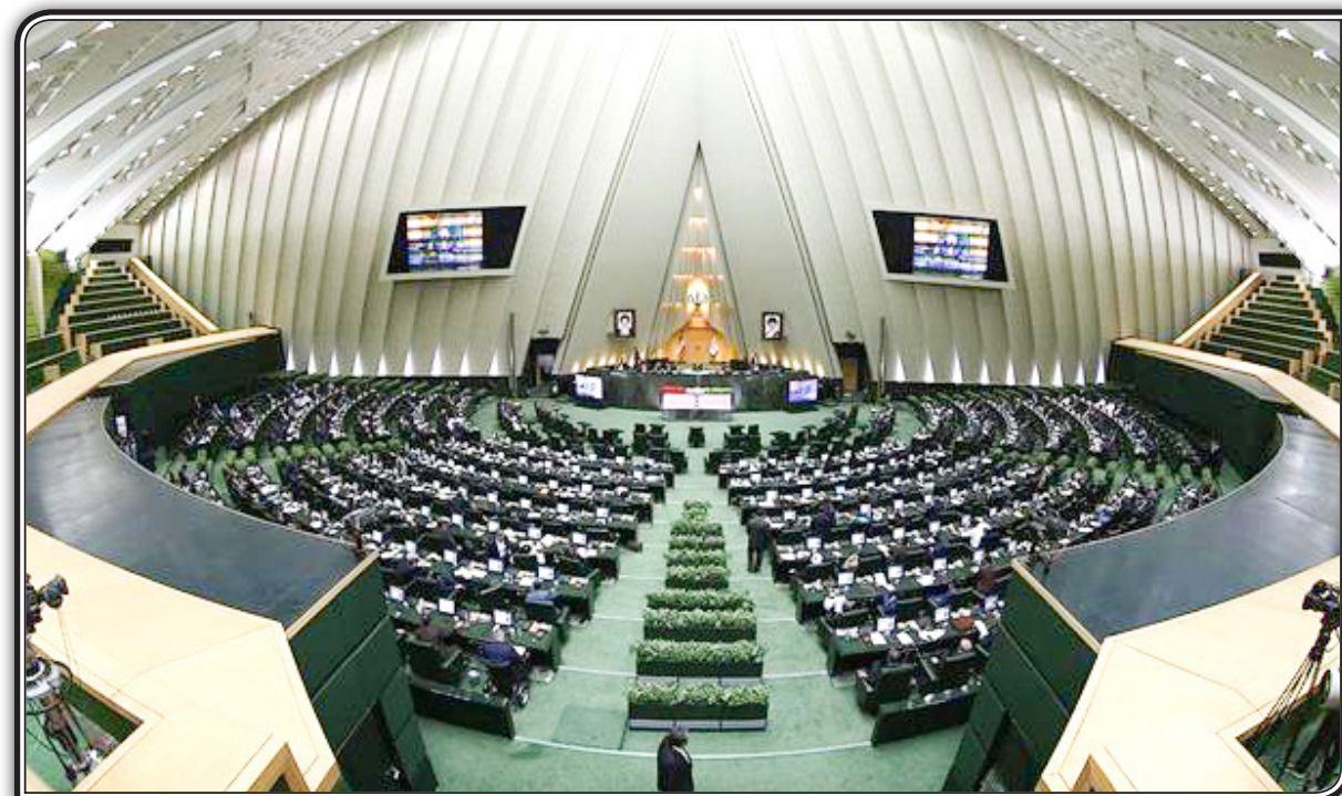
A general view of the Iranian parliament in session.

TEHRAN (Dispatches) -- Iran's lawmakers on Sunday overwhelmingly approved a motion in response to recent U.S. sanctions, voting to boost spending on Tehran's missile program and the Islamic Revolution Guards Corps (IRGC). In a session, 240 lawmakers voted for the bill, with only one abstention, to confront "America's terrorist and adventurous actions" in the region. The measure came after President Donald Trump signed into law a bill passed by U.S. Congress to impose new sanctions on Iran over its missile program in early August. Washington's new sanctions vio-