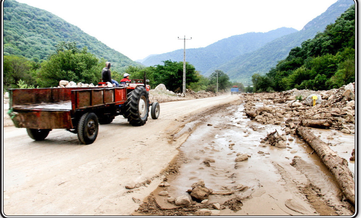
The aftermath of flash floods in Golestan province in northeast Iran.

TEHRAN (Dispatches) - Flash floods triggered by heavy rain in northeastern Iran have left at least 11 people dead and two missing, the Red Crescent said on Saturday.