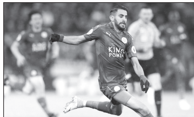
Riyad Mahrez scored 10 goals and provided seven assists for Leicester last season

LEICESTER (Dispatches) - Leicester City have rejected a bid from Roma for winger Riyad Mahrez, manager Craig Shakespeare has confirmed.