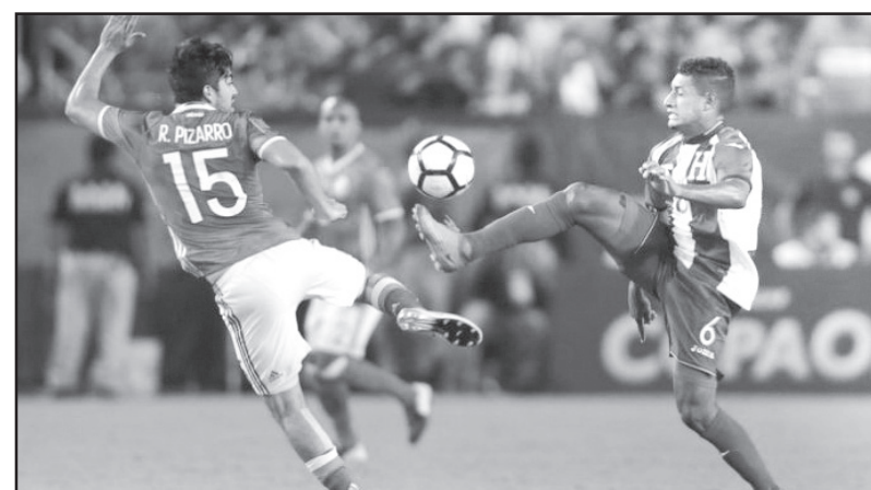
Thanks to an early goal from Rodolfo Pizarro (15), Mexico beat Honduras to reach the Gold Cup semifinals.

"It won't be done in the Paralympics, and I've no intention of ever racing Usain Bolt or able-bodied people, it's about racing against their time outside of the rules and regulations that limit technology."