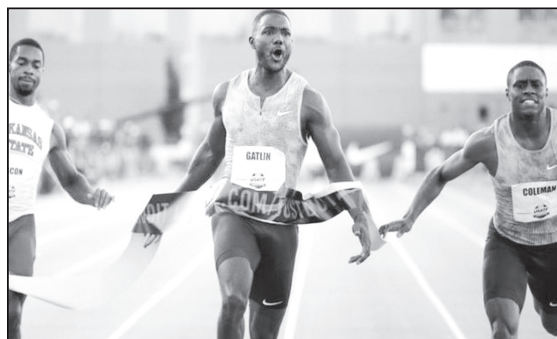
Justin Gatlin wins the men's 100m final at the U.S. World Championship trials ahead of Christian Coleman (right).

LONDON (Dispatches) - American Justin Gatlin has set up the prospect of a final showdown in London with Usain Bolt after winning the 100m in the U.S. World Championship trials.