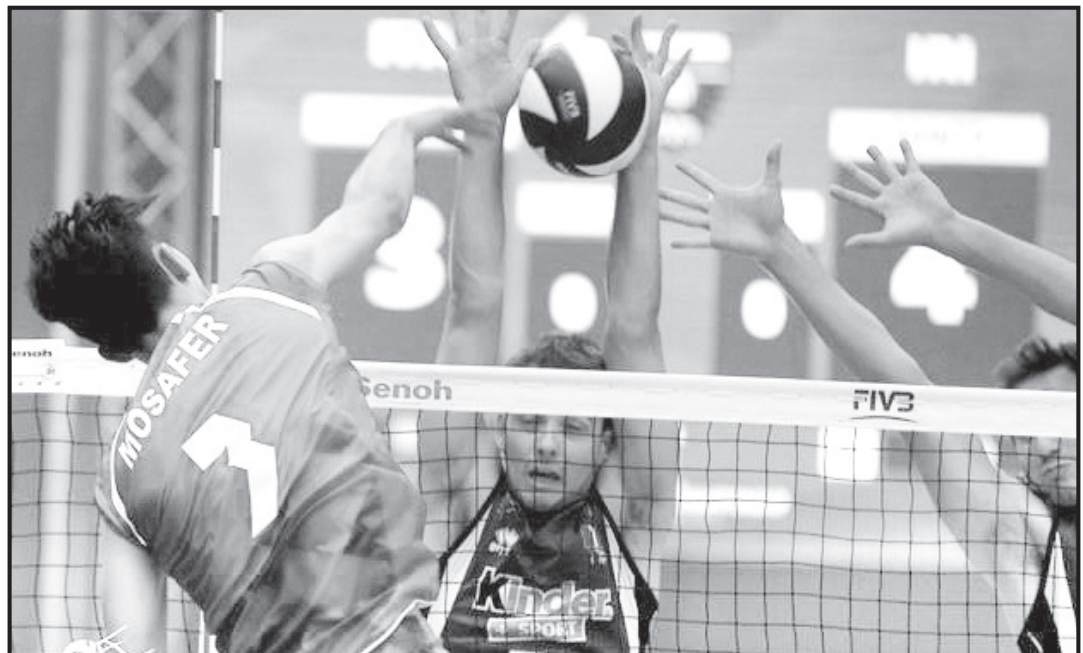
The photo shows a view of the Pool C match between Iran (players in red) and Italy at the 2017 FIVB Volleyball Men's U21 World Championship in České Budějovice, the Czech Republic, on June 23, 2017.

TEHARN (Dispatches) - Iran's national under-21 volleyball team has trounced Italy in straight sets at the 2017 Fédération Internationale de Volleyball (FIVB) Volleyball Men's U21 World