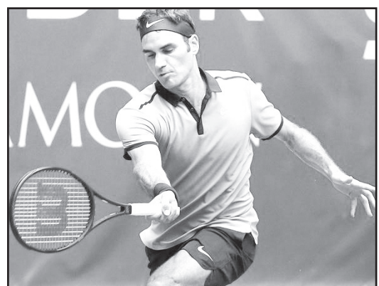
Roger Federer of Switzerland returns the ball during the men's singles quarterfinal match against Florian Mayer of Germany in the Gerry Weber Open 2017 in Halle, Germany, on June 23, 2017.

Federer, who has yet to drop a set in Halle after crashing out of Stuttgart in his first match back last week, limited his serve-and-volley game