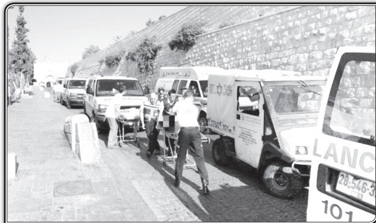
Zionist troops are carried to ambulances following a shooting attack on Israeli soldiers at the Haram al-Sharif in the Old City of Al-Quds on July 14, 2017.