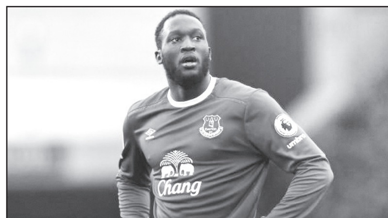
Lukaku wants to leave Everton this summer and United have stolen a march on Chelsea.

British media reported that the fee for the 24-year-old would be around 75 million pounds,