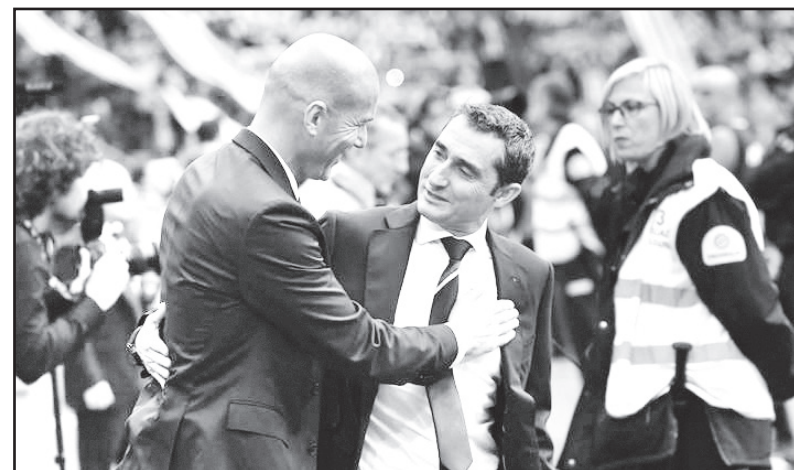
Ernesto Valverde managed Bilbao to their first trophy in 31 years when they won the Spanish Super Cup in 2015 beating Barcelona 5-1 on aggregate.

BARCELONA (Dispatches) - Barcelona are expected to name former Athletic Bilbao manager Ernesto Valverde as their new boss.