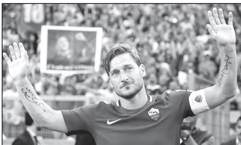
Francesco Totti played his last game for AS Roma on Sunday.

"I would have liked to write a poem or a song but I've tried to express myself with my feet," Totti added. "I'm taking my shirt off for the last time and folding it up well and good. The lights are turning off now and I'm afraid. Allow me to have a little fear. Now I need your help." Thousands of fans were in No. 10 shirts to honor their hero, while oth-