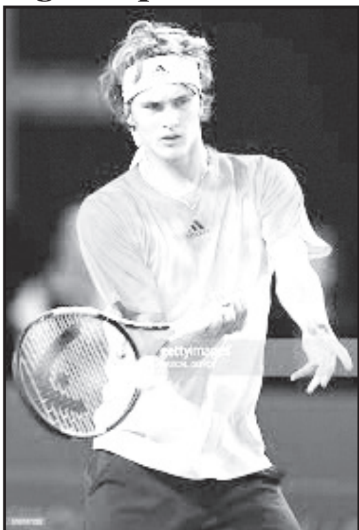
Alexander Zverev beat Novak Djokovic to win the Italian Open

"They are so big players that it's I think normal that they are still so good with a little bit older age," Thiem said. "But I wouldn't say that the younger players, they didn't make it. I mean there is Milos (Radic) or Kei (Nishikori) that have been in