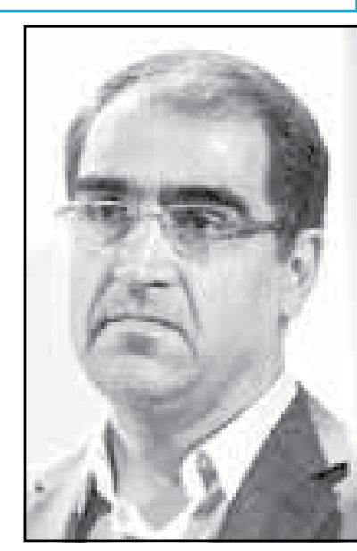
Iranian Health Minister Seyed Hassan Qazizadeh Hashemi

Democrats are not expected to back a plan which adds to the national debt.