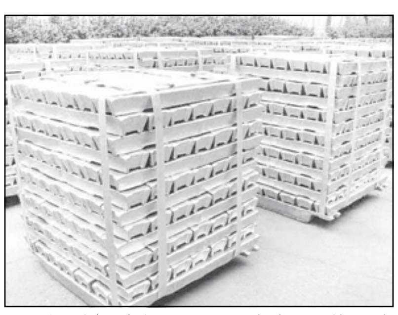
(Dispatches) - A senior Iranian industrial official has announced that the country