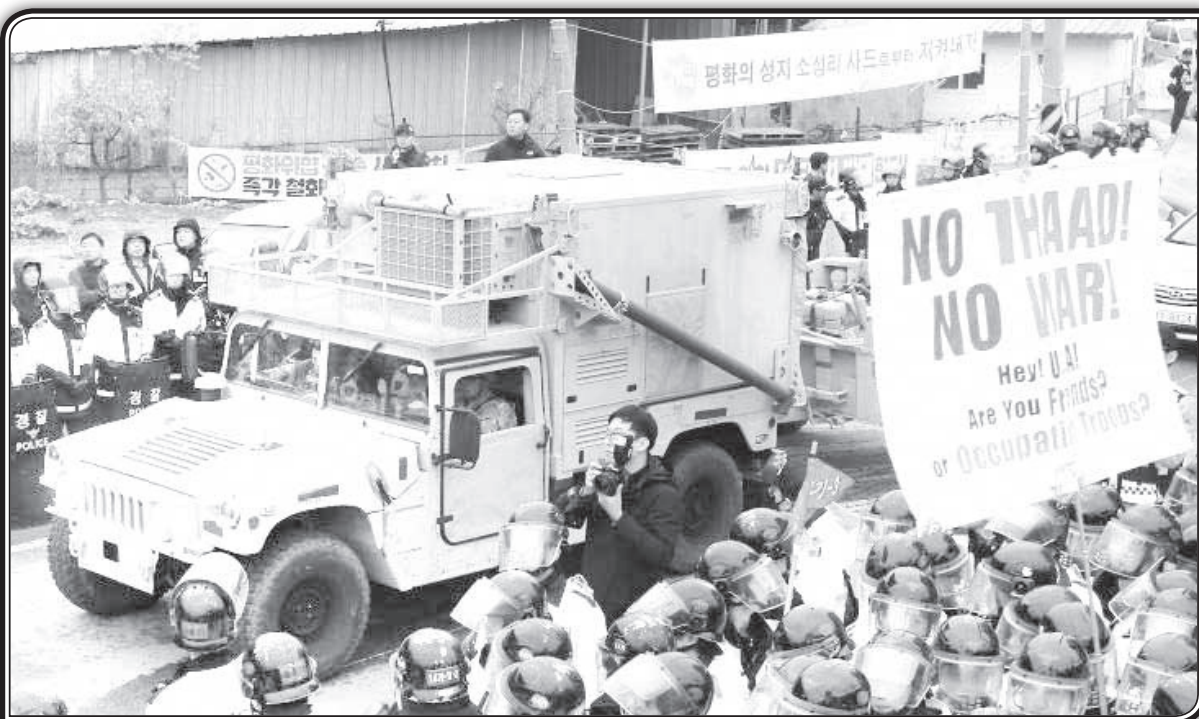
A U.S. military vehicle which is a part of Terminal High Altitude Area Defense (THAAD) system arrives in Seongju, South Korea, April 26, 2017.

SEOUL (Dispatches) -- The U.S. military started moving parts of a missile system to a deployment site in South Korea on Wednesday, triggering protests from villagers and criticism from China, amid tension over North Korea’s weapons development. The earlier-than-expected steps to deploy the Terminal High Altitude Area Defense (THAAD) system was also denounced by the front-runner in South Korea’s presidential election on May 9. South Korea’s defense ministry said elements of THAAD were moved to the deployment site, on what had been a golf course, about 250 km (155 miles) south of the capital, Seoul. “South Korea and the United States have been working to secure an early operational capability of the THAAD system in response to North Korea’s advancing nuclear and missile threat,” the ministry said in a statement. The battery was expected to be operational by the end of the year, it said. The United States and South Korea agreed last year to deploy the THAAD to counter the alleged threat of missile launches by North Korea. They say it is solely aimed at