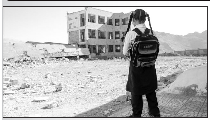
A Yemeni school girl stands outside a school damaged in an airstrike in the southern Yemeni city of Ta'izz, March 16, 2017.

SANAA (Dispatches) - Yemen's Houthi Ansarullah fighters and their allies in the army have reportedly fired a long-range ballistic missile at the Saudi capital Riyadh, a few hours ahead of U.S. President Donald Trump's visit to the kingdom.