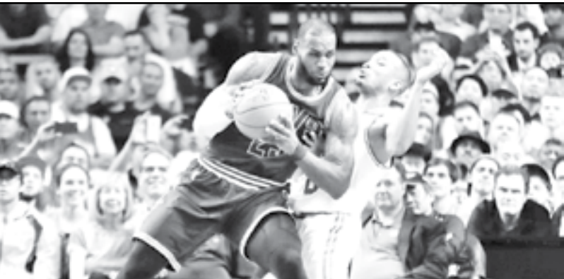
Cleveland Cavaliers forward LeBron James, left, muscles his way to the basket as Boston Celtics guard Avery Bradley, right, tries to defend during first half of Game 2 of the NBA basketball Eastern Conference finals, Friday, May 19, 2017.

WASHINGTON (Dispatches) - LeBron James scored 30 points, Kevin Love had 21 points and 12 rebounds as the Cleveland Cavaliers beat the Boston Celtics 130-86 on Friday, breezing to a 2-0 lead in the Eastern Conference finals.