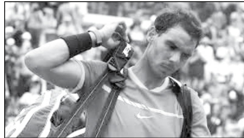
Seven-time champion Rafael Nadal is out of the Italian Open

ROME (Dispatches) - Seven-time champion Rafael Nadal is out of the Italian Open after a straight-set defeat by Dominic Thiem of Austria in the quarter-finals in Rome.