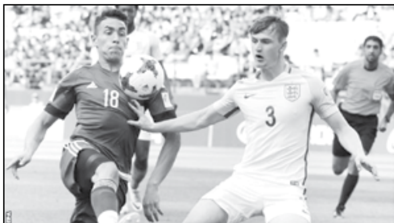
England's victory on Saturday ended a 17-match winless streak

Guinea on Tuesday before a game against hosts South Korea next