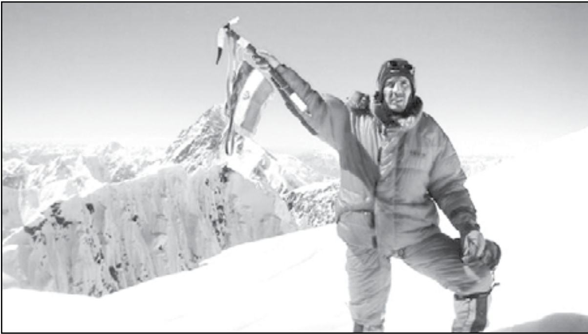
Iranian mountain climber Azim Gheichisaz

TEHRAN (Press TV) - Iranian mountain climber Azim Gheichisaz has joined one of the world's most elite groups of mountaineers known as the '8,000ers' after climbing all 14 of the world's highest peaks.