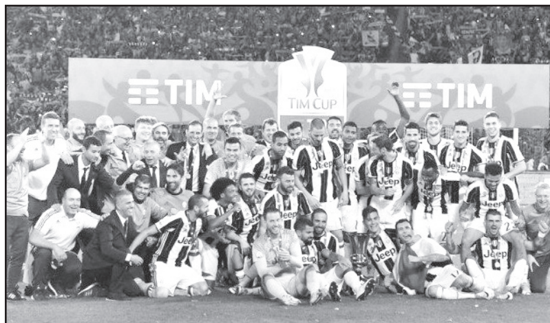
Juventus' players pose with the trophy after winning the Italian Tim Cup final on May 17, 2017 at the Olympic stadium in Rome.

ROME (Dispatches) - Juventus have secured a record third successive Italian Cup as Dani Alves and Leonardo Bonucci struck one apiece to seal a 2-0 victory over Lazio at the Stadio Olimpico.