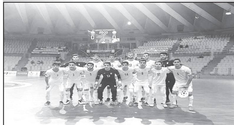
Iran men's national under-20 futsal team

TEHRAN (Dispatches) - Iran's national futsal team has posted its third resounding win in a row at the 2017 Asian Football Confederation (AFC) U-20 Futsal Championship in Thailand, thrashing the Chinese squad in the group stage of the continental tournament.