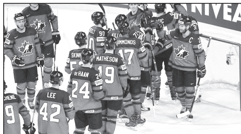
Players of Canada celebrate victory after the quarterfinal match against Germany of the 2017 IIHF Ice Hockey World Championship in Cologne, Germany on May 18, 2017.

COLOGNE (Dispatches) - Germany's run at the Ice Hockey World Championship in Cologne have come to an end after a 2-1 defeat by favorites Canada. Russia, who beat the Czech Republic, await Canada in a mouthwatering semifinals.