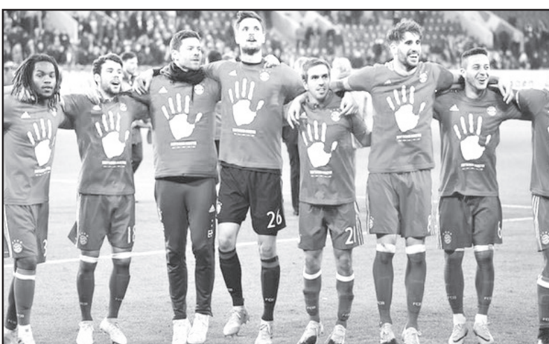
Bayern celebrate their fifth successive title win

MUNICH (Dispatches) - Bayern Munich secured a record-extending fifth consecutive Bundesliga title after beating Wolfsburg 6-0 to open up an unassailable 10-point lead with three matches remaining. The Bavarians, who have won 27 German championships, are on 73 points, with RB Leipzig in second place on 63 after they were held to a goalless draw by Ingolstadt.