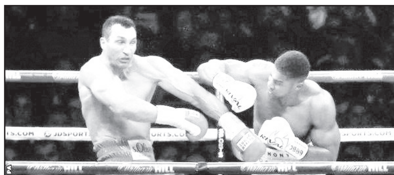
Wladimir Klitschko suffered the fifth defeat of his career

LONDON (Dispatches) - Anthony Joshua produced the performance of his career to add the WBA world heavyweight title to his IBF crown with an enthralling knockout win over Wladimir Klitschko at Wembley Stadium.