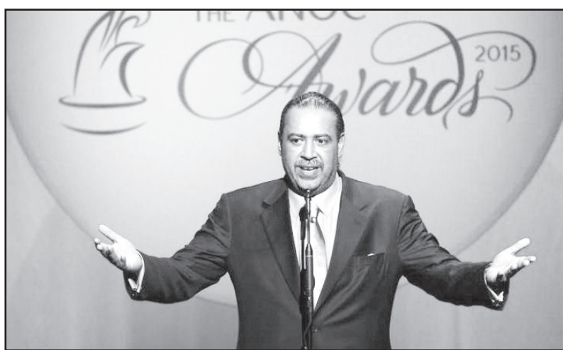
Sheikh Ahmad Al-Fahad Al-Ahmed Al-Sabah