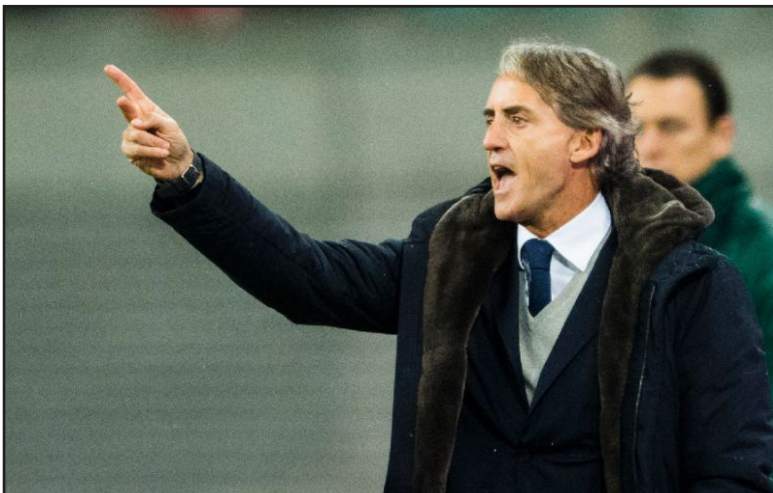
Roberto Mancini won league titles with both Man City and Inter Milan, but has struggled in Russia with Zenit

ROME (AFP) - Zenit St Petersburg coach Roberto Mancini has revealed in an emotional interview how coaching his native Italy would be "extraordinary".