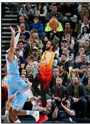
Ricky Rubio #3 of the Utah Jazz passes the ball against the Sacramento Kings on March 17, 2018 at vivint.SmartHome Arena in Salt Lake City, Utah.

De'Aaron Fox made a free throw and dunked off a pass from Garrett Temple to rally the Kings into a 94-all tie with 1:11 remaining. But Joe Ingles, Rubio and Gobert each made two free throws to make it 100-94 with