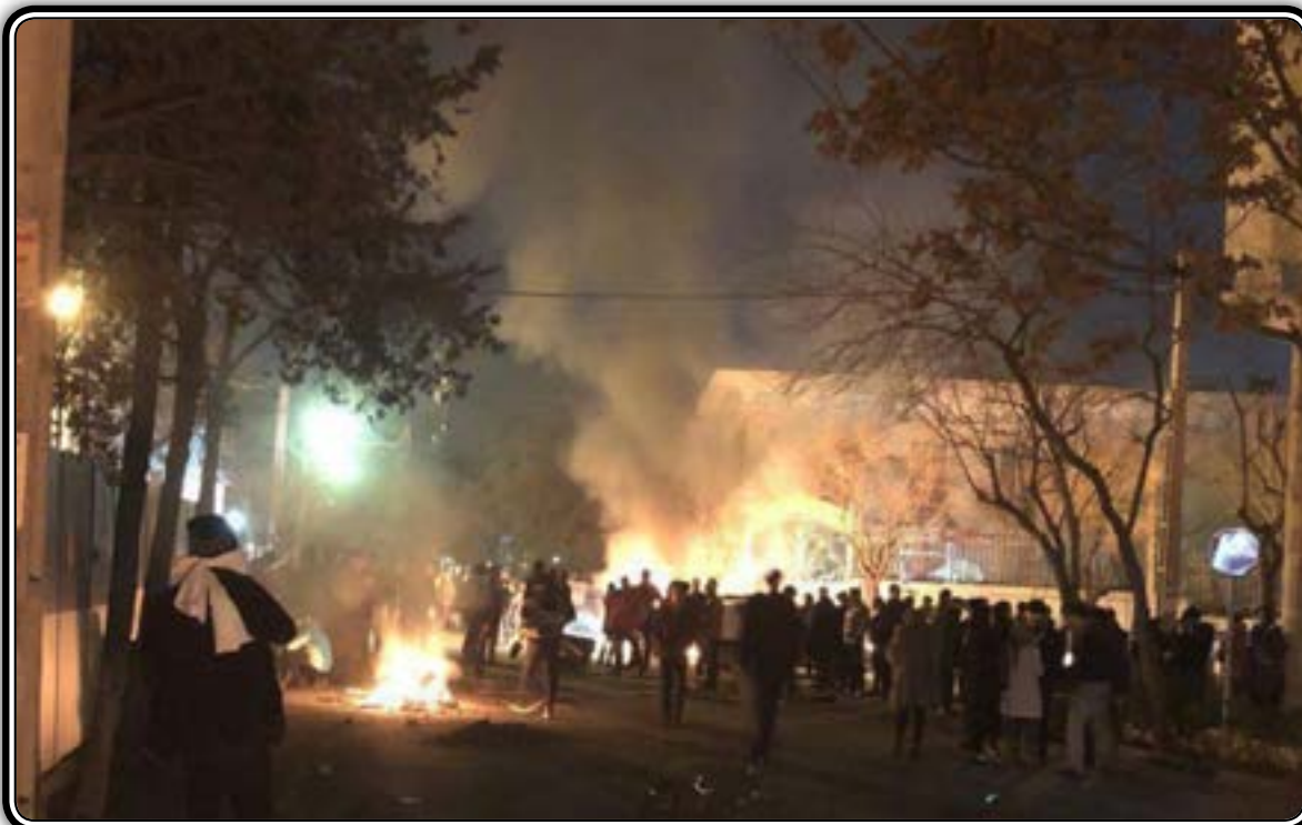
Violent cult members ploughed cars into police and bystanders and damaged public and private property in northern Tehran, Monday night.

TEHRAN (Dispatches) – Interior Minister Abdolreza Rahmani Fazli here on Wednesday decried deadly attacks by followers of a cult leader on security forces in northern Tehran, saying those behind the violence will be dealt with firmly.