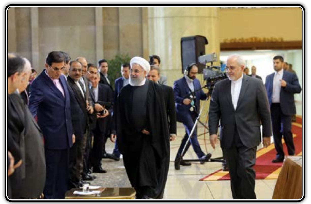
President Rouhani and Foreign Minister Muhammad Javad Zarif arrive for a press conference with foreign ambassadors in Tehran on Feb. 10, 2018.