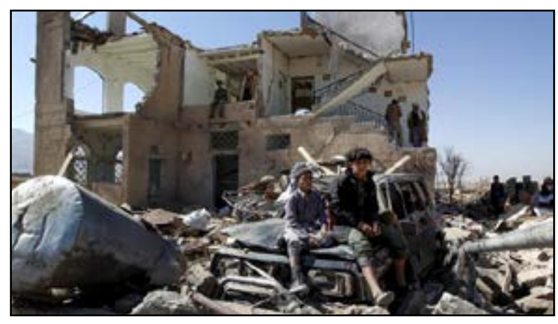
This file photo taken on November 14, 2016 shows children sitting amidst the rubble of a house hit by Saudi-led coalition airstrikes two days earlier on the outskirts of the Yemeni capital Sana'a.

Also on Sunday, Yemen's War Media said the Army's snipers had taken out seven members of the Saudi Arabian military in counterattacks against various locations in the kingdom's Jizan border region.