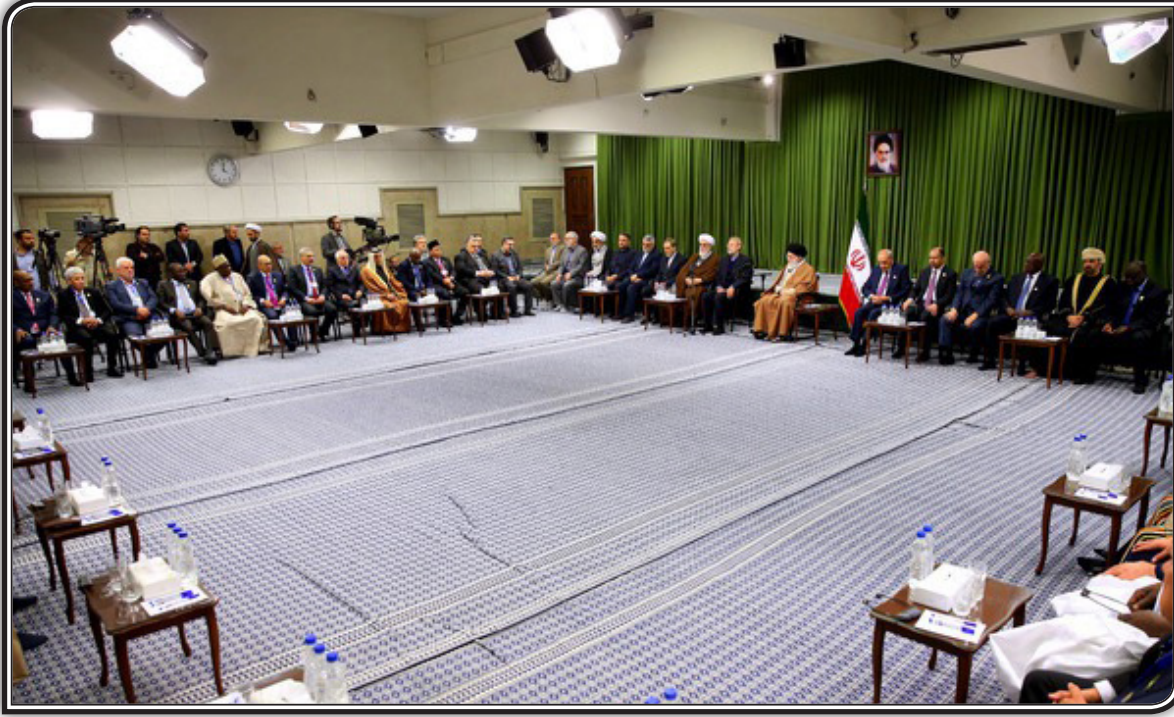
Ayatollah Khamenei meets senior Muslim parliamentarians who attended a session of the Parliamentary Union of the Organization of Islamic Cooperation (OIC) Conference in Tehran, Jan. 16, 2018.

TEHRAN (Dispatches) – Leader of the Islamic Revolution Ayatollah Seyyed Ali Khamenei here on Tuesday urged Muslim countries to counter the “dangerous and horrific Western propaganda empire” which is run by the Zionists.