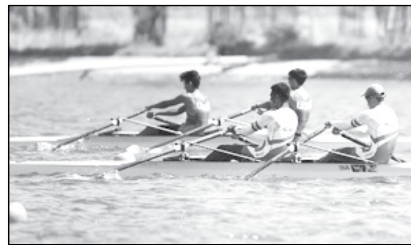
Iran's quad scull team reaches ARJC semifinals

TEHRAN (MNA) - Four-strong rowing team of Iran has secured a place in semifinals of the 2016 Asian Rowing Junior Championships (ARJC) underway in Thailand.