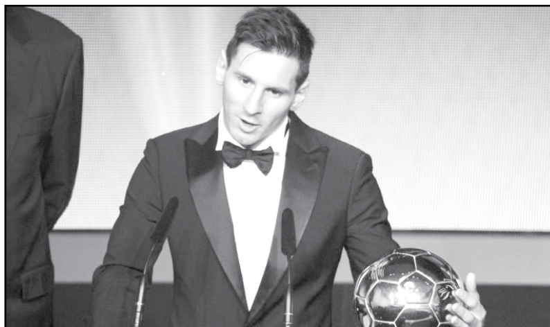
Messi, Modric nominated for Ballon d'Or

Riyad Mahrez enjoys his first nomination, having inspired Leicester City to a remarkable Premier League title triumph with displays that secured him the PFA Player of the Year award in