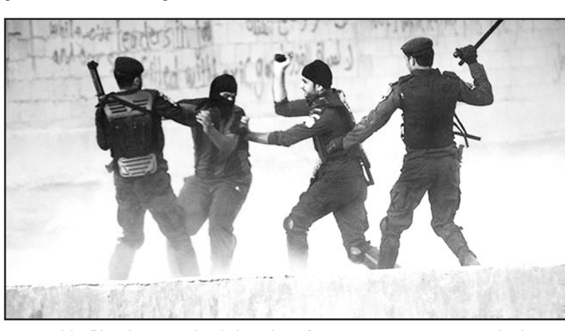
In this file photo, Bahraini regime forces arrest a protester during demonstration against the ruling regime in the village of Shakhora,

took place as regime soldiers did not forces attacked a group of anti-regime fired tear gas canisters to disperse the protesters in the village of Eker, and