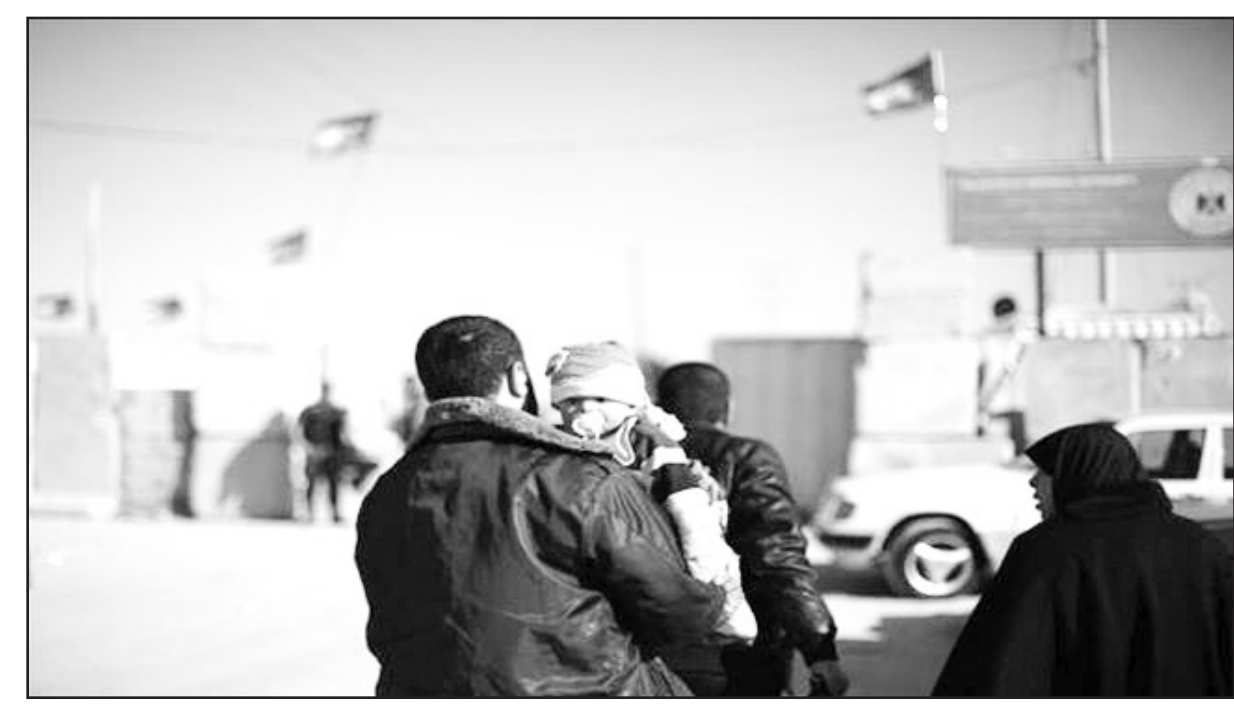
The file photo shows a Palestinian man holding a child near the Erez crossing in Beit Hanun, north of the Gaza Strip.