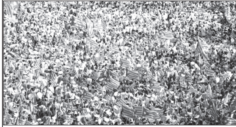
People hold Catalan separatist flags known as "Esteladas" during a gathering to mark the Catalonia day "Diada" in central Barcelona, Spain, September 11, 2016.

MADRID (Dispatches) - The president of Spain's Catalonia region on Wednesday said he would call a Scotland-style independence referendum in September 2017, in a move likely to infuriate Madrid.