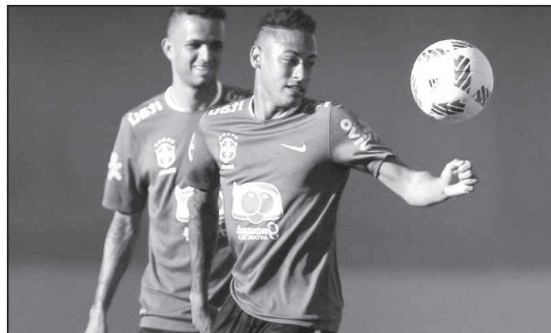
Brazil's Neymar during a training session before their international friendly soccer match against Japan.

GIOANIA (thehindu) - Barcelona forward Neymar will captain Brazil at the Rio 2016 Olympic football tournament, the team's head coach said on Friday.