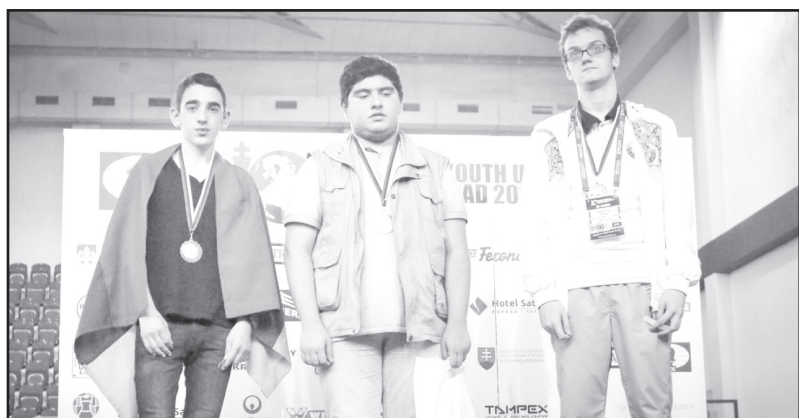
Iran scoops gold at World Youth Chess Olympiad

TEHRAN (MNA) – Iran's national cadet chess team have won the title of 2016 Worlds U-16 Chess Olympiad by defeating Romanian rivals in the final round.