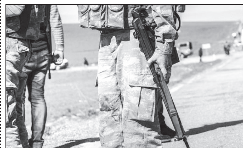
Blood is seen on the uniform of a Turkish soldier following an attack on an army vehicle at Lice in Diyarbakir, southeastern Turkey.

ANKARA (Dispatches) – Turkish fighter jets have conducted fresh air strikes against the positions of the Kurdistan Workers' Party (PKK) in northern Iraq and southeastern Turkey.