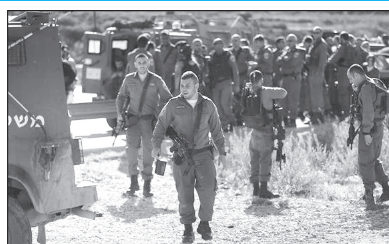
Zionist troops gather at the scene where a Palestinian man was shot at the Tapuah junction, south of Nablus in the Zionist-occupied West Bank.

An international French-backed conference is planned to convene