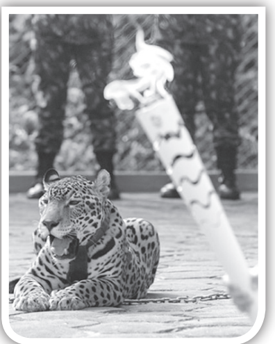
Jaguar Juma is pictured during the Olympic Flame torch relay in Manaus, Brazil

“No request was made to authorize the participation of the jaguar ‘Juma’ in the event of the Olympic torch,” Ipaam said in a statement.