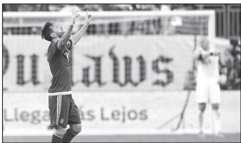
Argentina’s Lionel Messi celebrates after scoring against the US during their Copa America Centenario semifinal football match in Houston, Texas.

Houston (AFP) - Lionel Messi became Argentina’s all-time record goal scorer as the two-time world champions outclassed the United States 4-0 to reach the Copa America Centenario final.