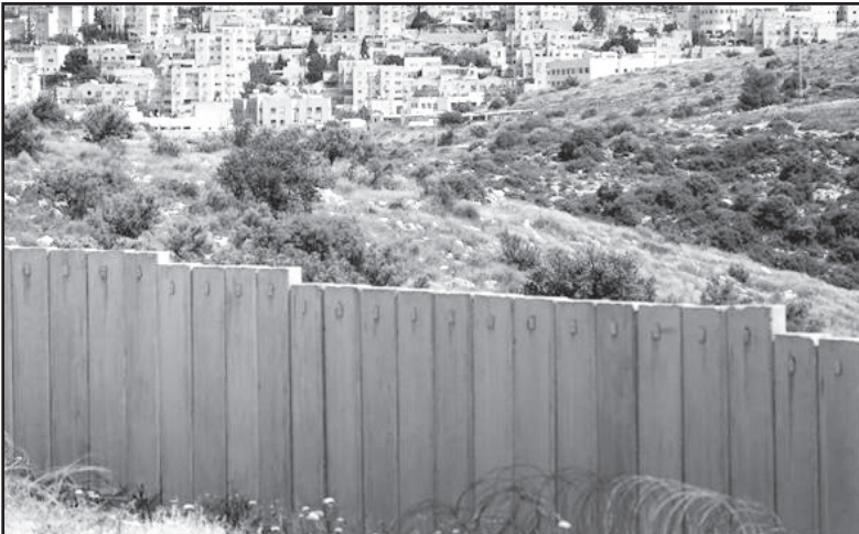
A general view of the Zionist settlement of Moddin Elite surrounded by a separation wall near the West Bank city of Ramallah

In recent years, most such moves have failed, but several similar bills