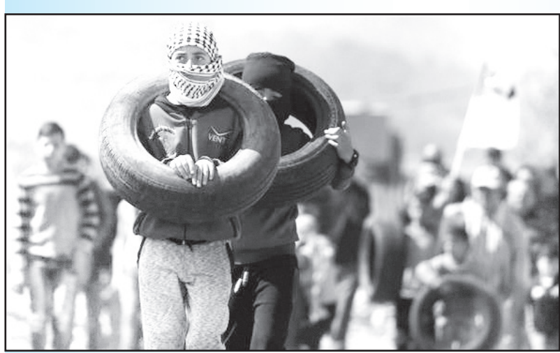
Palestinian protesters carry tires during a weekly demonstration against the expropriation of Palestinian land by the Zionist regime in the town of Kfar Qaddum, near Nablus, in the occupied West Bank on February 24, 2017.

WEST BANK (Dispatches) -The Zionist regime's troops have clashed with hundreds of Palestinian protesters on the anniversary of a 1994 massacre carried out by a far-right Jewish settler in the southern part of the occupied West