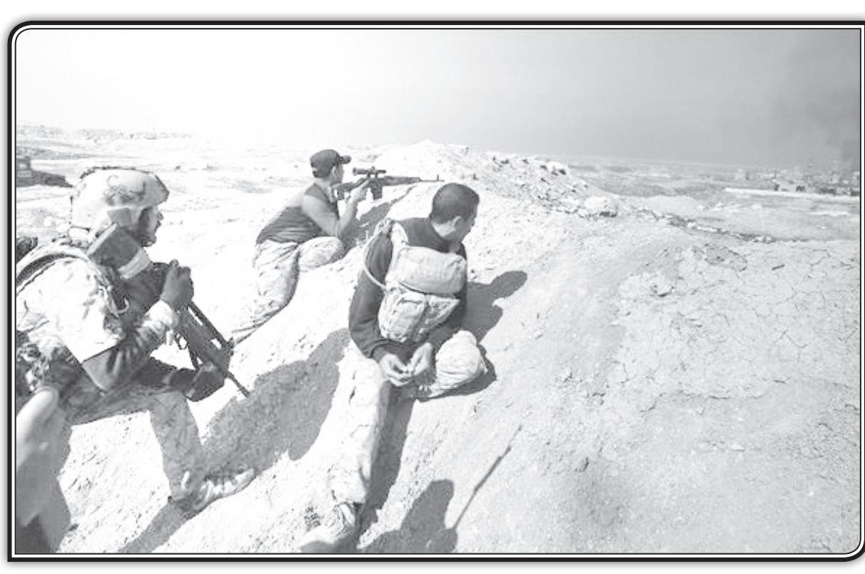
Iraqi forces advance on February 23, 2017 towards Mosul airport on the southern edge of the city of Mosul prior to entering the airport compound for the first time since the Daesh terrorist group overran the region in 2014.

BAGHDAD (Reuters) - Iraqi offensive launched last week allies finished clearing Daesh forces pushed deeper into western Mosul on Saturday, advancing in several populated southern districts after punching through the defenses of Daesh terrorist group's last major urban stronghold in Iraq a day earlier.