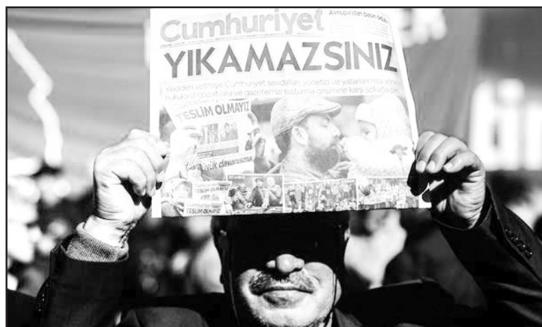
A Turkish protester holds a copy of the latest edition of opposition newspaper “Cumhuriyet” during a demonstration outside the daily’s headquarters in Istanbul on November 2, 2016.

In February, Turkey arrested Die Welt journalist Deniz Yucel, whom Erdogan has described as both a German spy and a representative of the outlawed militant group Kurdistan Workers’ Party (PKK). The arrest triggered a row between Ankara and Berlin.