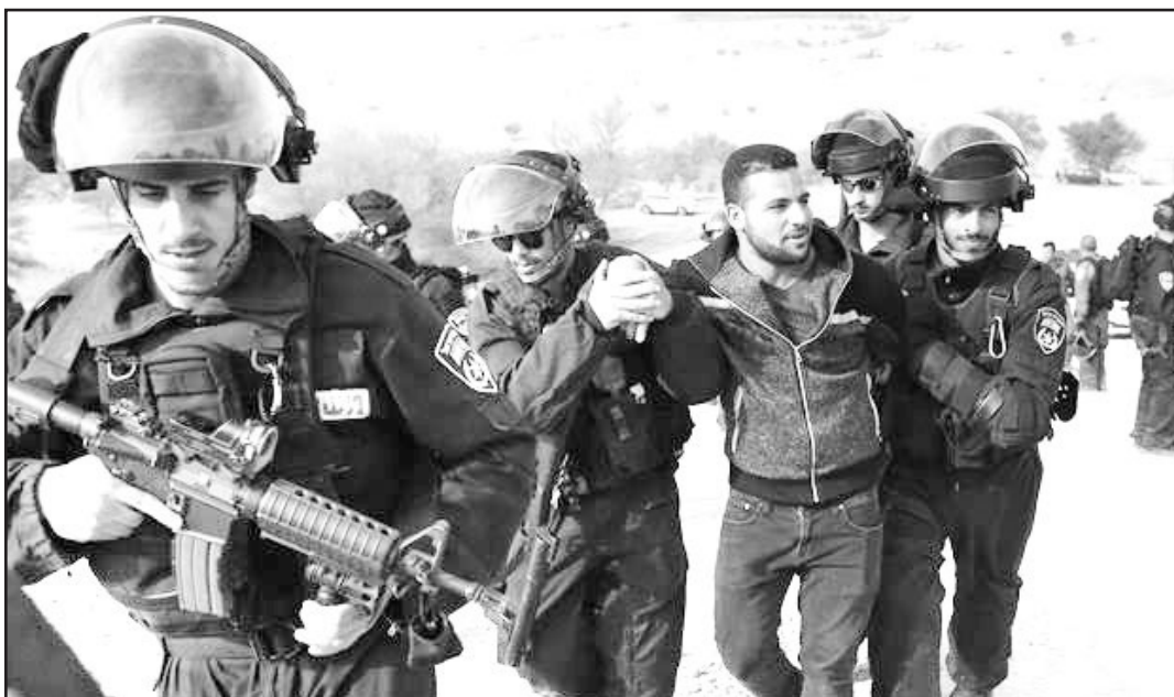
The Zionist regime’s police detain a Bedouin protester on January 18, 2017 in the village of Umm al-Hiran near Beersheba in the Negev desert.

The Zionist regime, it said, “has allocated lands and provided planning services for over 600 Jewish communities since its establishment in 1948, yet it has not created a single Arab locality aside from the seven it established to concentrate the Bedouin community in the south.”