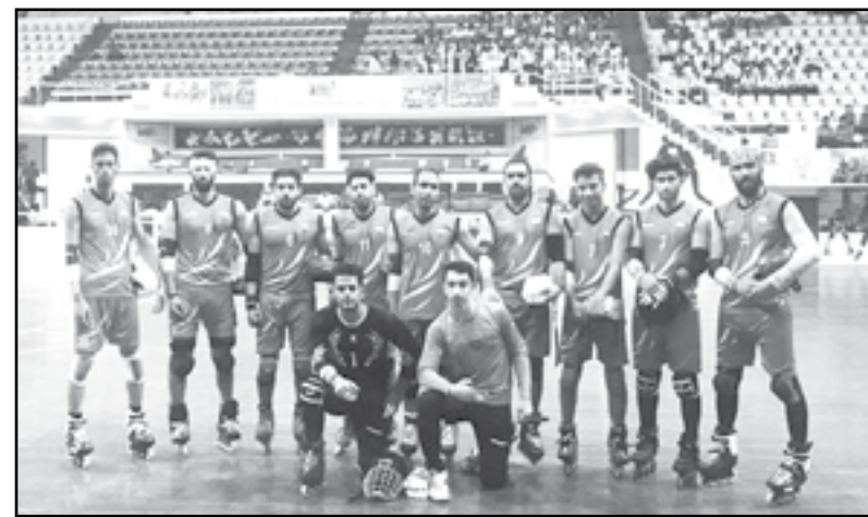
Iran men's national rollball team

TEHRAN (Press TV) - The Iranian men's national rollball team has triumphed over Tanzania for the second straight win at the preliminary round of the fourth edition of Rollball World Cup in Bangladesh.