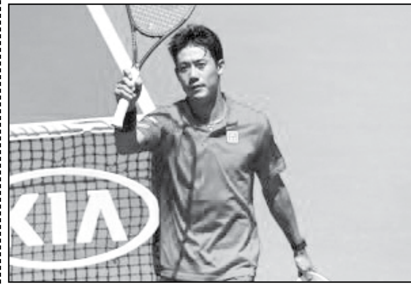
Japanese top seed Kei Nishikori reached his second final of 2017 with a gruelling 4-6, 6-4, 6-3 win over Argentina's Carlos Berlocq

BUENOS AIRES (AFP) - Japanese top seed Kei Nishikori reached his second final of 2017 with a gruelling 4-6, 6-4, 6-3 win over Argentina's Carlos Berlocq at the Buenos Aires clay court tournament.