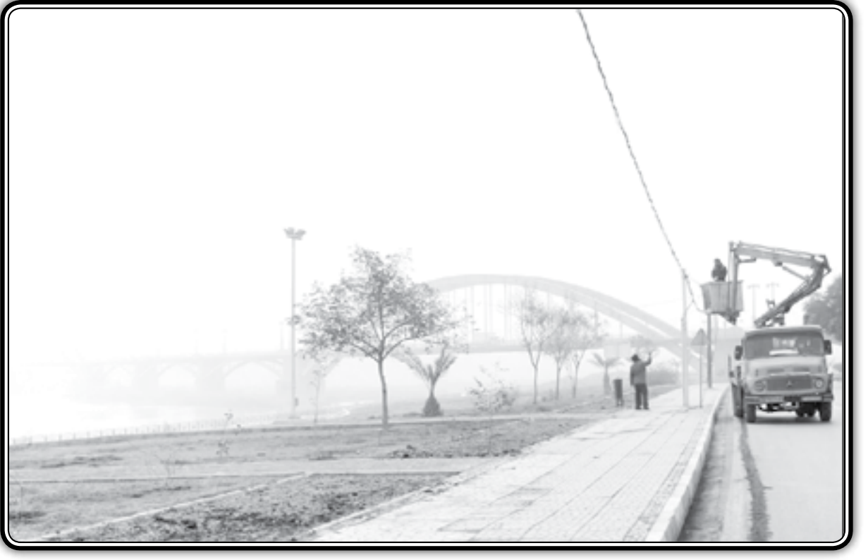
The iconic bridge on Karoun River is hardly visible in a haze of dust, with power grid workers attending to a transmission line in Ahvaz.

TEHRAN (Press TV) -- Iran's oil-rich Khuzestan province is struggling to emerge from backto-back power outages which have severely disrupted life and led to expressions of discontent with local authorities and the government.