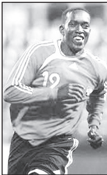
Dwight Yorke denied entry into the U.S.

Yorke who was travelling on personal business, also acts as