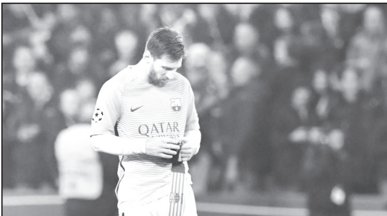
Real Madrid are set to supersede Barcelona as the leading club in Europe, according to former Italy coach Arrigo Sacchi.

ROME (Dispatches) –Former Italy coach Arrigo Sacchi has said that Barcelona's era as the dominant force in European football is over, proclaiming: "A king has died".