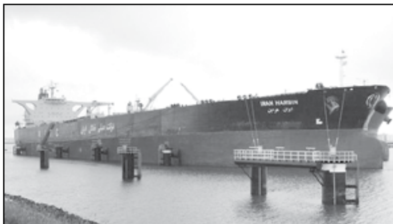
This undated photo shows Iran Harsin supertanker docked at Europoort, Rotterdam.