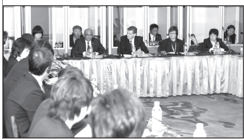
First AFC Women's Elite Coaches' Forum charts success for women's football in Asia

KUALA LUMPUR (AFC) -Asia's top women's football coaches gathered at the first AFC Women's Elite Coaches' Forum on Monday and Tuesday this week in Kuala Lumpur, Malaysia, to map out a successful future for women's football on the continent.