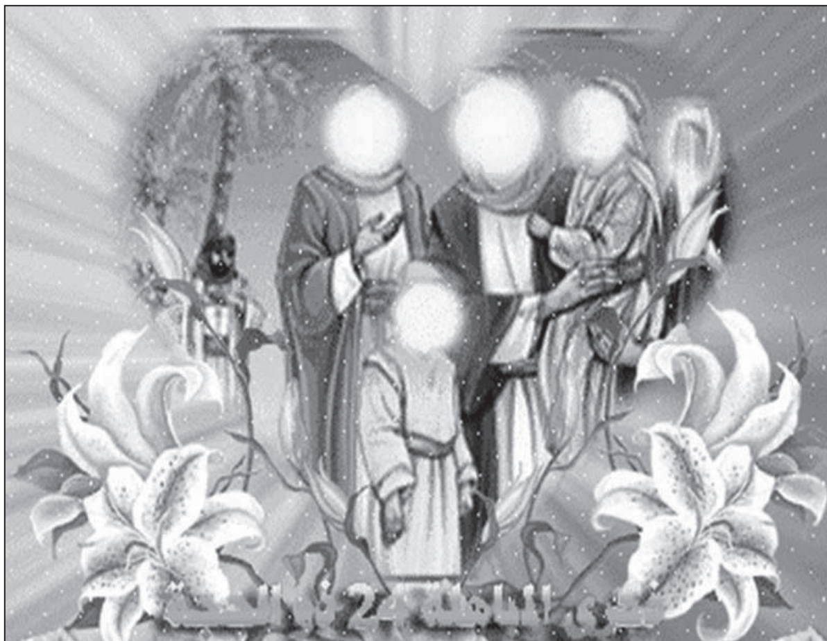
...let us call our sons and your sons, our women and your women, our souls and your souls...

We earnestly pray to God Almighty to hasten the reappearance of the Lord of the Age, Prophet Muhammad's (SAWA) 12th and Last Infallible Heir, Imam Mahdi (AS), who will reappear to establish the global government of peace, prosperity and justice by weeding out oppression and corruption from Planet Earth. Amen.