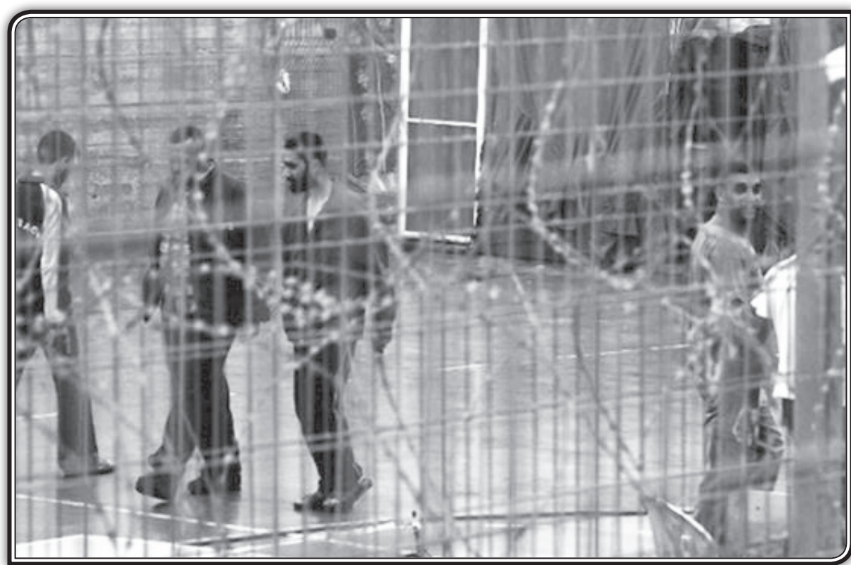
The file photo shows Palestinian prisoners in a Zionist jail.

WEST BANK (Dispatches) – Palestinians have blasted a Zionist law that allows the Guantanamo-style force-feeding of Palestinian prisoners who are on hunger strike in the regime's jails.