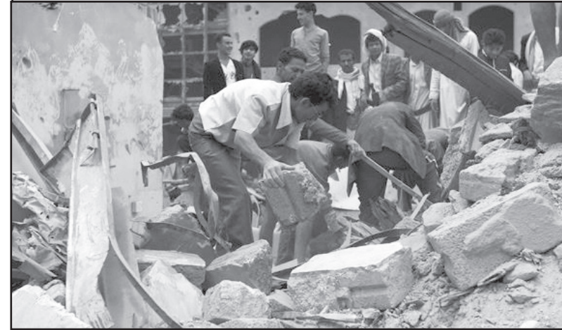
A vendor tries to salvage goods from under the rubble of his shop following a Saudi airstrike on the Yemeni capital, Sana'a.

RIYADH (Press TV) – Saudi Arabia has conducted fresh attacks on Yemen as international organizations voice concern about the humanitarian situation in the impoverished Arab country.