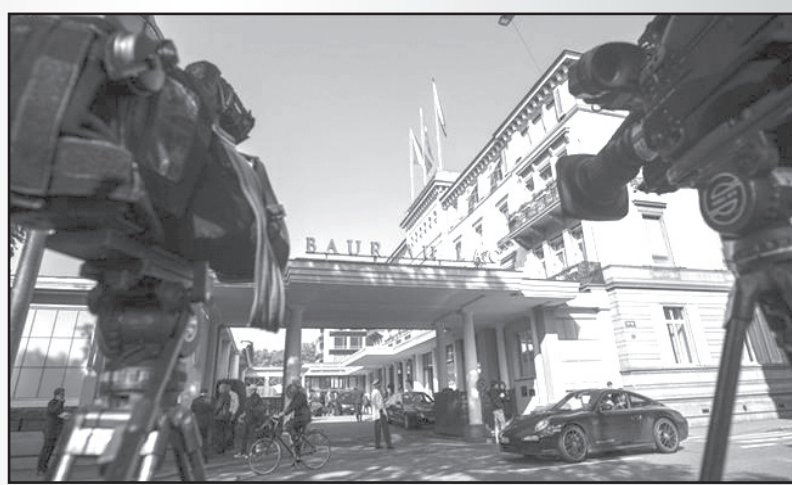
The media gathers outside the Hotel Baur-au-Lac in the Swiss city of Zurich, where police arrested six FIFA officials on corruption charges

"In return, it is believed that they received media, marketing, and