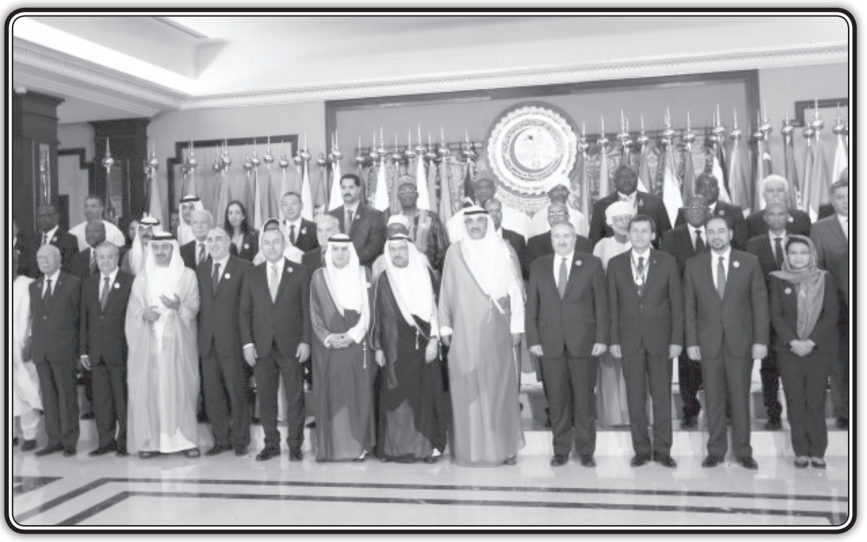
Foreign ministers of the Organization of the Islamic Cooperation pose for a group photo in Kuwait.

TEHRAN (Press TV) -- Iran's Foreign Minister Muhammad Javad Zarif and his Kuwaiti counterpart have stressed the necessity of confronting Takfiri terrorist groups in the Middle East.