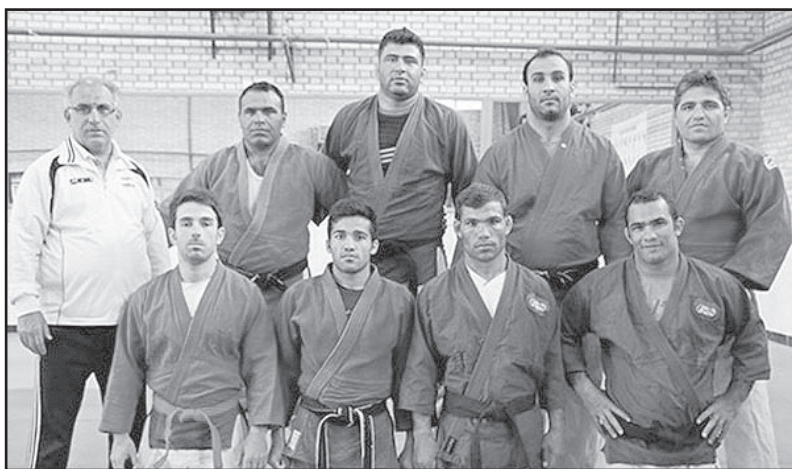
Iran’s national men Kurash team

BEIRUT (FNA) – Iran’s national men Kurash team won the title of the 2015 Asian Championships in Lebanon.