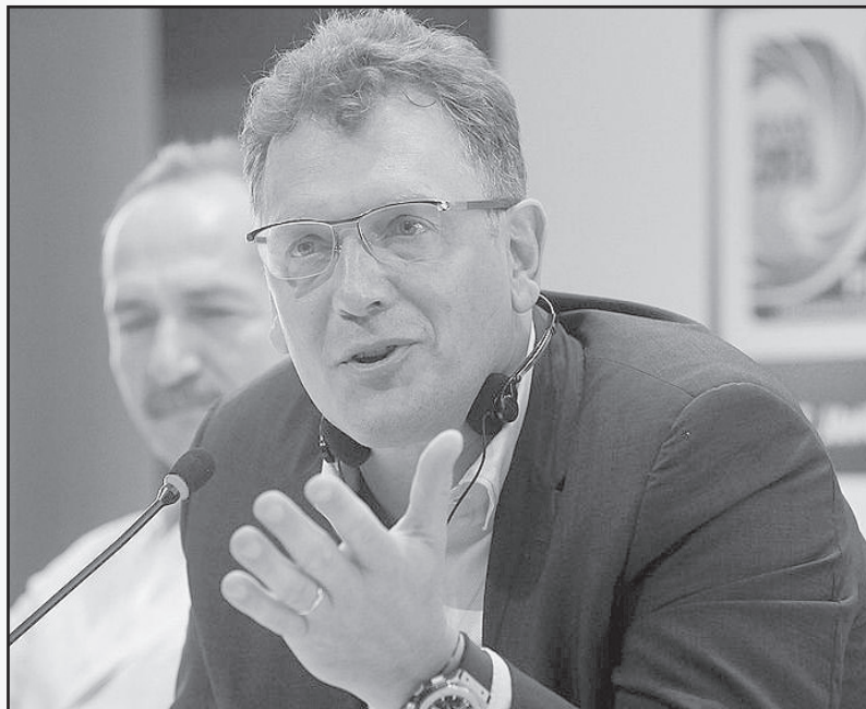
FIFA Secretary General Jerome Valcke

thing I agree, over the last two weeks I would not say reached the bottom, but has reached a level which is definitely a level which we will not go lower than," Valcke said.